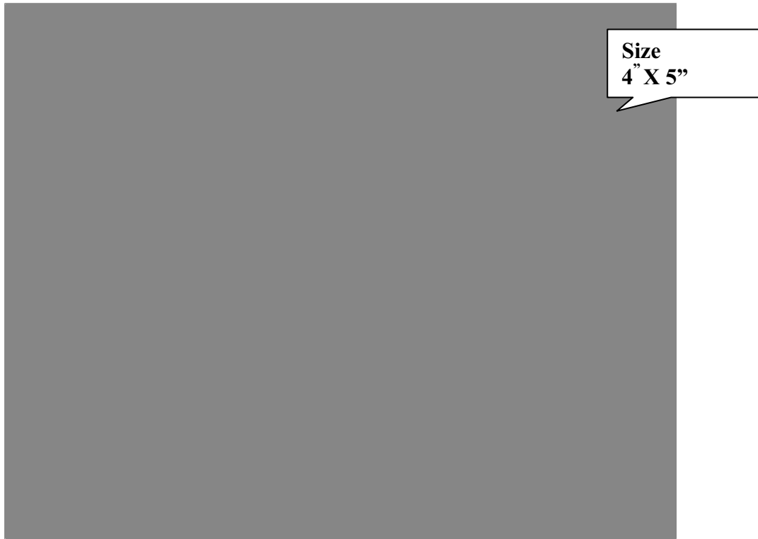
Fig. 1. Pseudo Second order plot for Copper and Lead on RRH and RHA